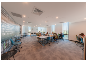
Big & Spacious Study Room