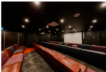
State of the Art Cinema Room